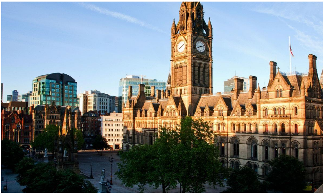
Albert Square – Christmas Market