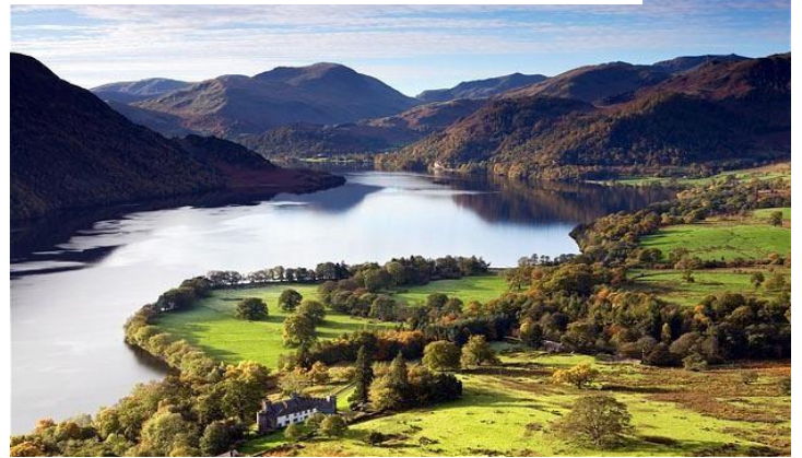
The Lake District