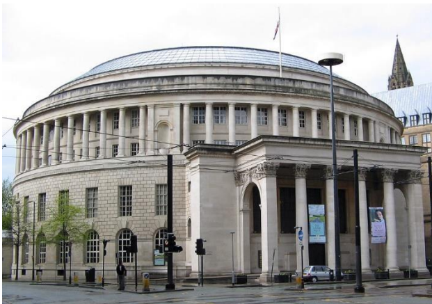
St Peter's Square

St Peter's Square and Albert Square – some of the most beautiful landmarks in Manchester: Manchester Central Library and the Town Hall. Every Christmas this part of the city turns into a spectacular Christmas market. Other festivals such as food and music festivals as well as St. Patrick's Day celebrations and open air sports events also take place in Albert Square – it's definitely the place to be! 5 minutes walk from the school.