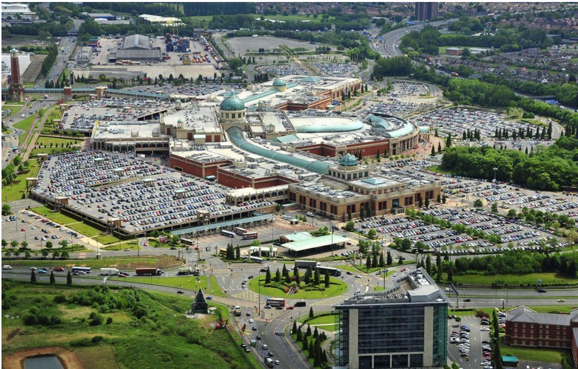
Trafford Centre – one of the biggest shopping & leisure centres in the UK