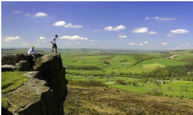
The Peak District