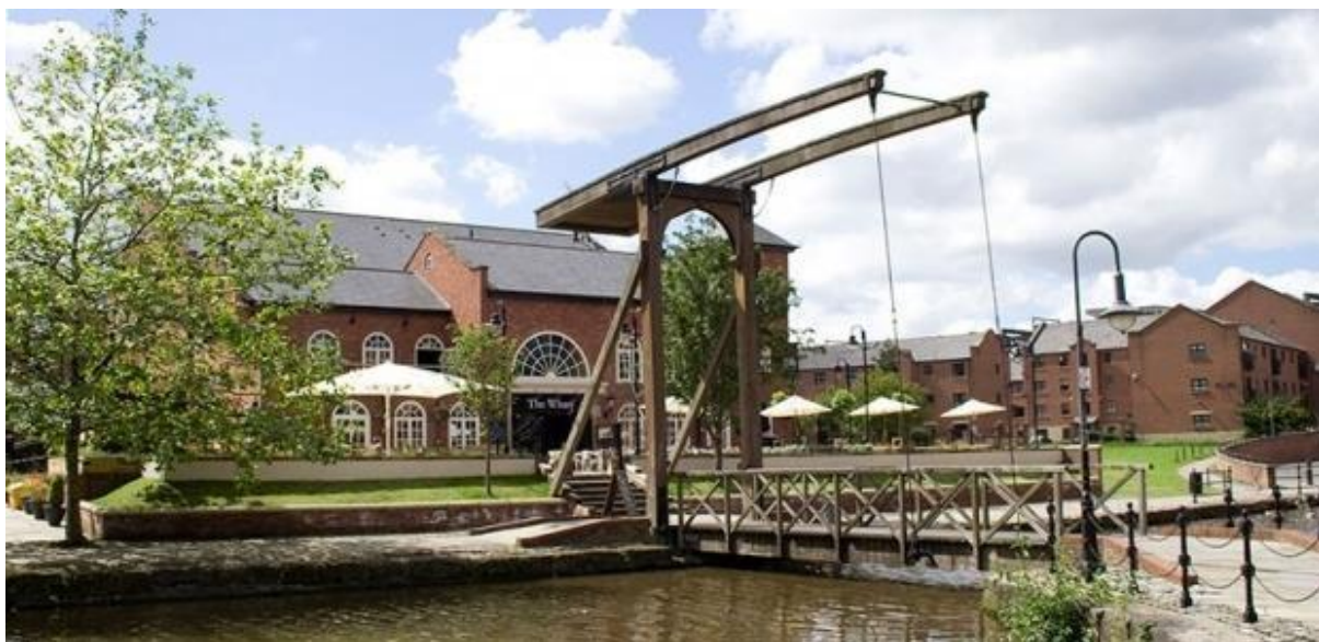
The Wharf – one of the most popular pubs in Castlefield