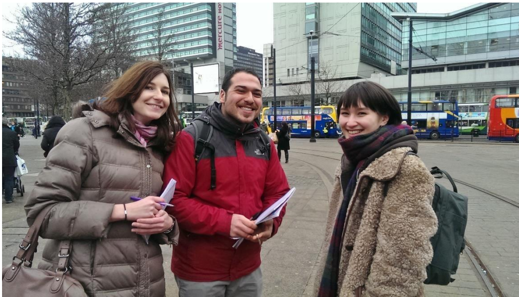
Communicate students in Piccadilly Gardens

Market Street and Arndale Shopping Centre – one of the main shopping districts in Manchester – always busy and filled with street entertainers. 10 min walk from the school.