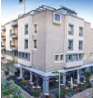
SE Paceville School