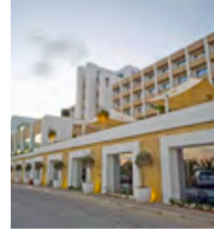
ESE Salini Resort