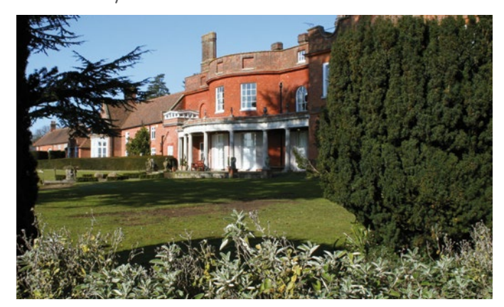
OLD BUCKENHAM HALL TEENAGE RESIDENTIAL COURSES (12-15 years) PAGES 8/9