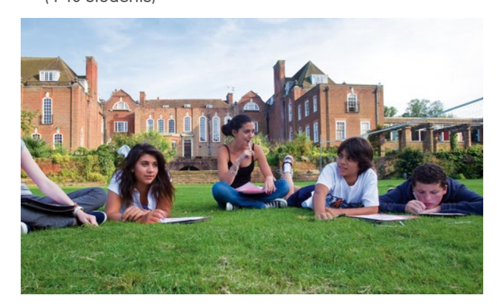
PRINCESS HELENA COLLEGE TEENAGE RESIDENTIAL COURSES (14-17 years) PAGES 10/11